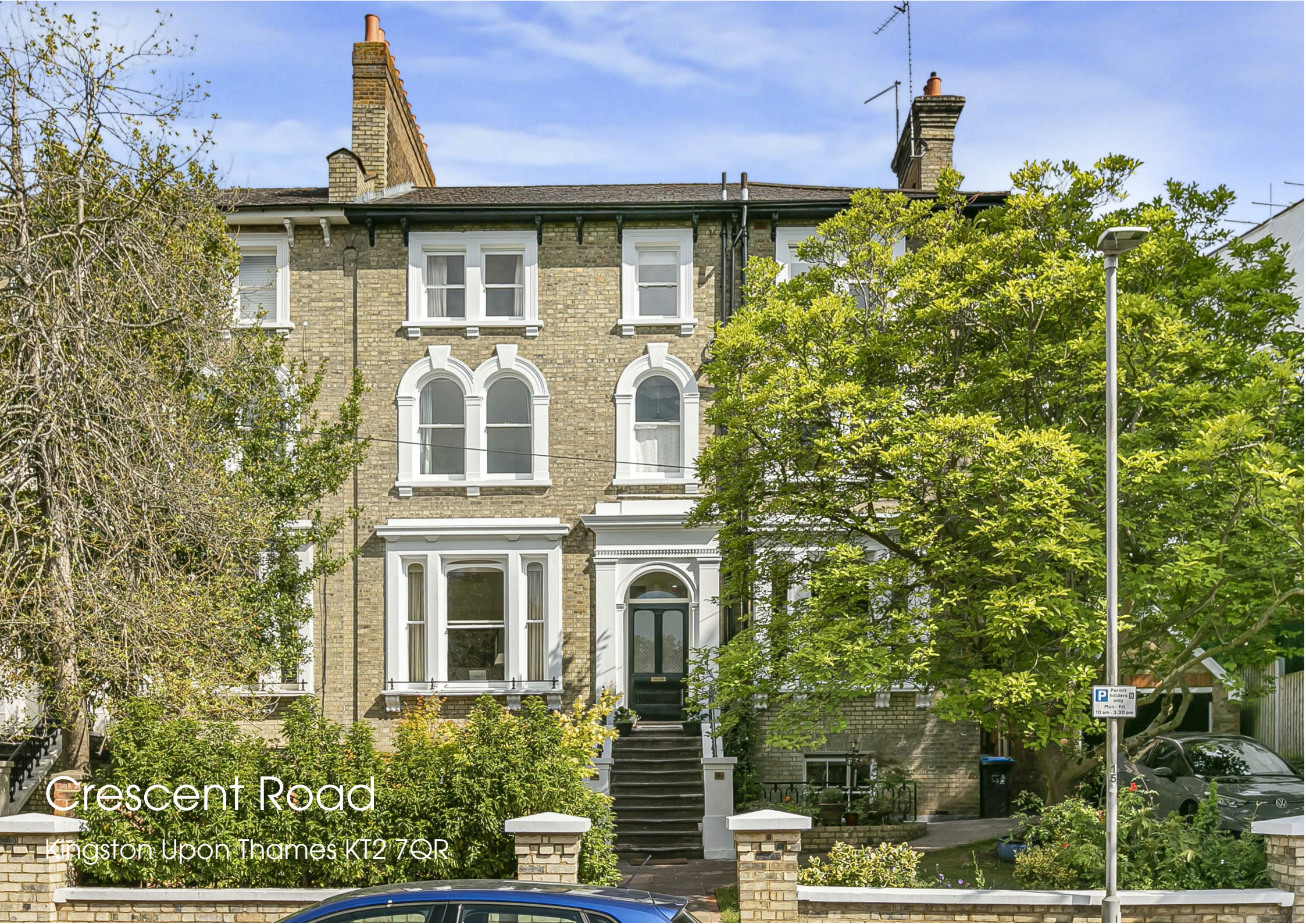
Crescent Road Kingston upon Thames KT2 7QR